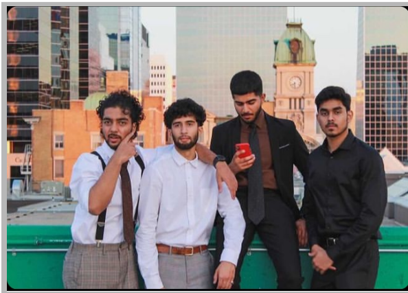
Class of 2021 Graduates

"Words for the class of 2021 to remember: "Change takes courage." —Alexandria Ocasio-Cortez."