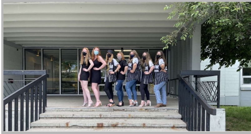
Grad Shoe Day

“All I can think of is C's get degrees, but probably don't put that! Ha!”