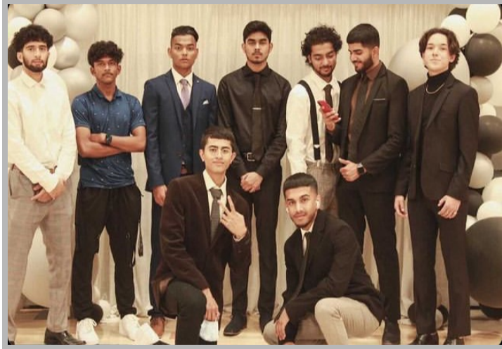
Class of 2021 Graduates

“Being with friends. Befriending teachers.”