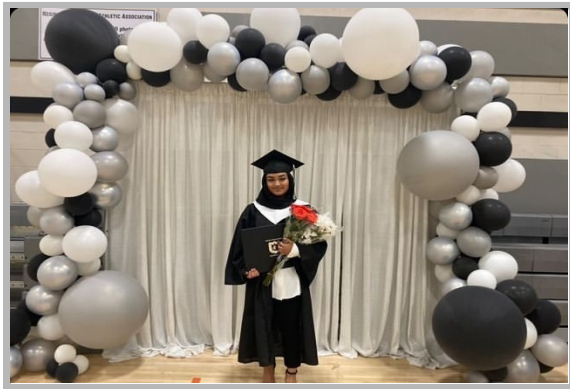
Class of 2021 Graduate

“Congratulations on your huge milestone graduates!! I wish you all happiness and success in all of your future endeavors. Always believe in yourself and you will be sure to succeed.”