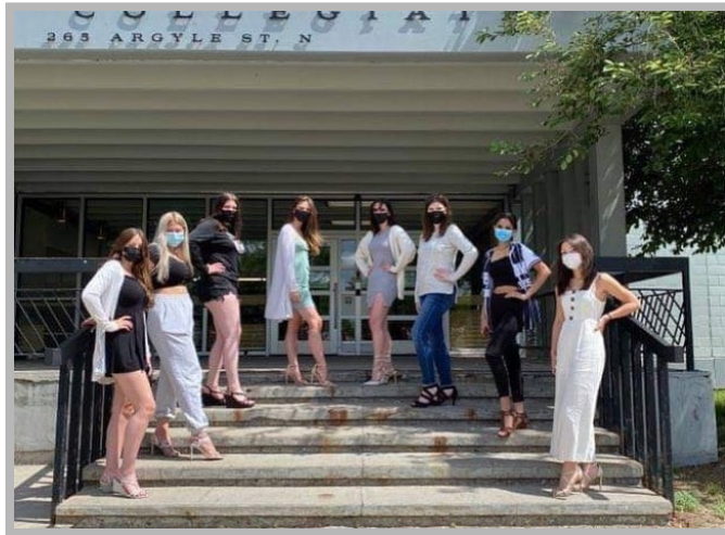
Grad Shoe Day, Graduates of the Class of 2021

“The whole Beat Cancer week is a vibe! Especially including the Jail and Bail fundraiser. The assemblies used to be amazing, especially the teachers’ challenge and “Gatin’s Feud’s.”