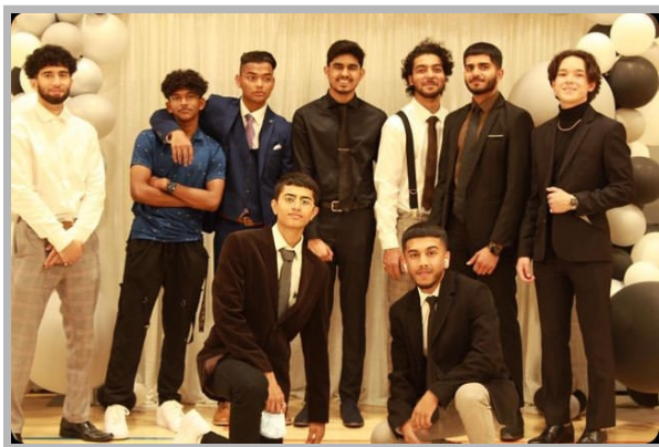
Class of 2021 Graduates

“Congratulations Graduates! The 2020-2021 school year was a difficult one and each of you deserve extra kudos for your hard work, flexibility and motivation to persevere through it all. I hope you celebrate your success with everyone who helped and encouraged you along the way. Best wishes for your next adventure!”